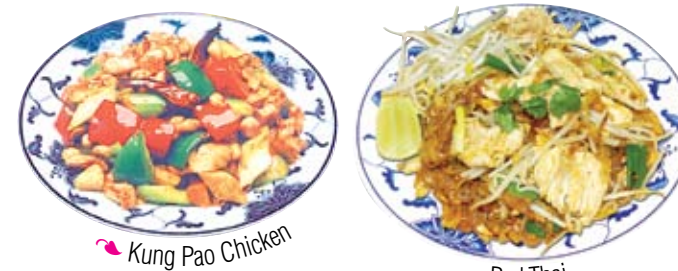
🍷 Kung Pao Chicken